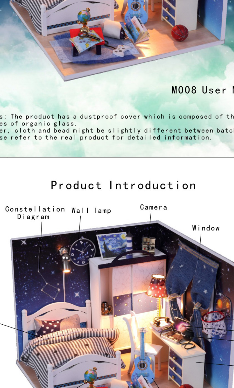
M008 User Manual

Notes: The product has a dustproof cover which is composed of three pieces of organic glass. Timber, cloth and bead might be slightly different between batches, please refer to the real product for detailed information.